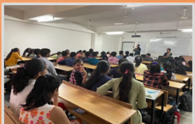
Games & Activites

Students were engaged in various Games and Sports where separate groups were made and tasks were given to entertain them