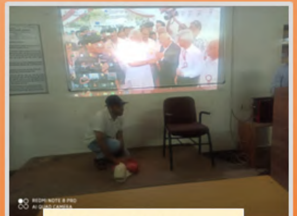
BLS - Workshop