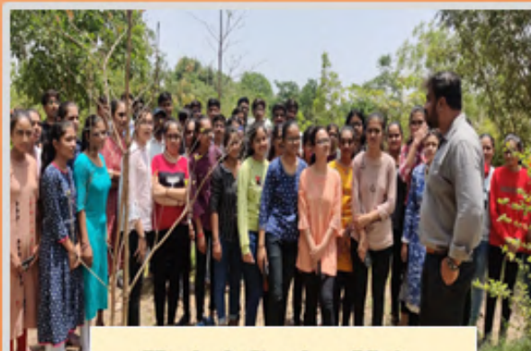
Herbal Garden Visit

Herbal Garden Visit was arranged to familiarize with Ayurvedic medicinal plants at our herbal garden and pharmacy visit was arranged to understanding about manufacturing of medicine at our ayurved pharmacy.