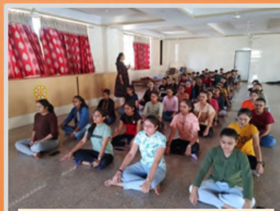
YOGA & MEDITATION